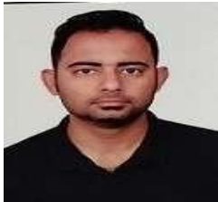
Samples of photographs which are not acceptable